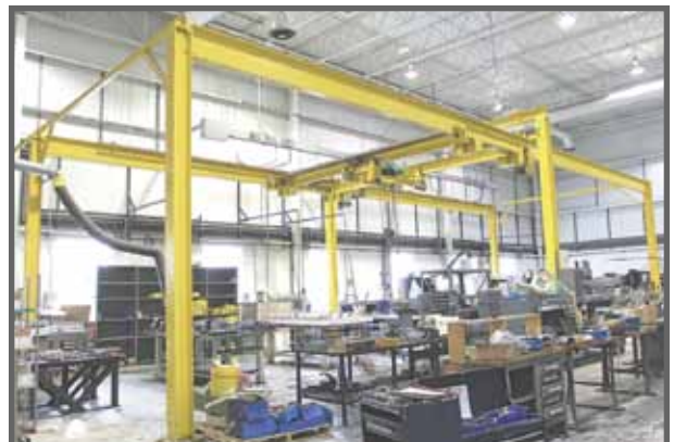
P&H 5 TON FREE STANDING BRIDGE CRANE

To discuss your requirements for an auction, please call Perfection Industrial 847.427.3333