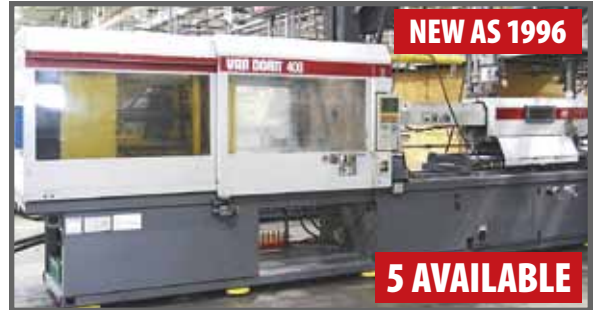
VAN DORN 400 TON INJECTION MOLDER