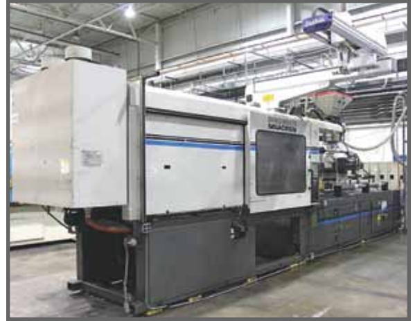
CINCINNATI MILACRON 500 TON INJECTION MOLDER