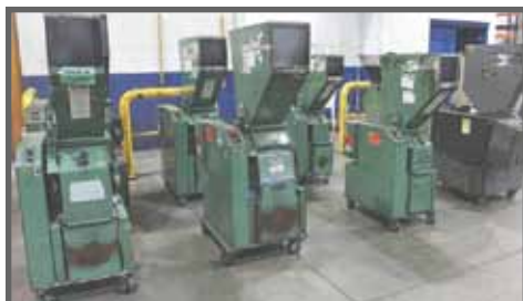
VIEW OF GRANULATORS