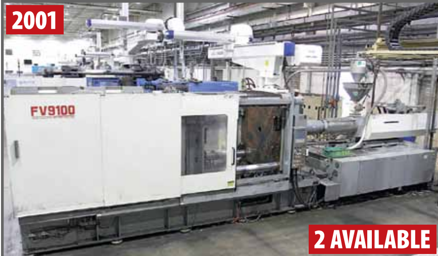
NISSEI 720 TON INJECTION MOLDER