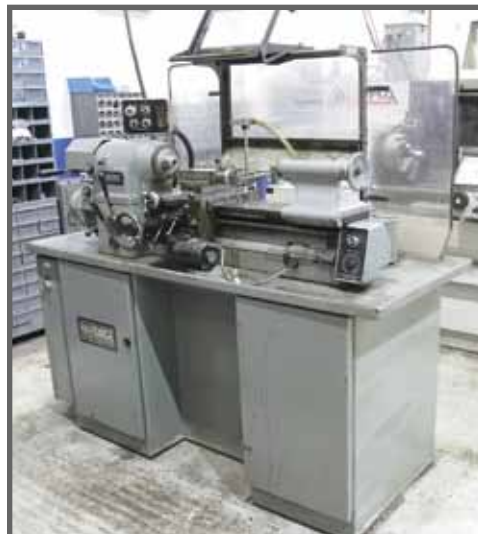
HARDINGE HLV-H TOOLROOM LATHE

ELTEE PULSITRON TR20 RAM TYPE ELECTRICAL DISCHARGE MACHINE , S/N 635, 6" x 6" Permanent Magnetic Work Chuck, System 3R Rotary Work Head w/Magnetic Control, Heidenhain 3-Axis DRO, Model EP30 Console Control, S/N 0762, Fire Suppression System, External Dielectric Fluid System