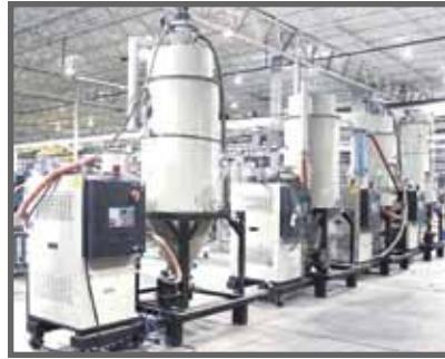
VIEW OF MATERIAL DRYERS

(3) ADVANTAGE ENGINEERING POWER TOWER SERIES WATER COOLING TOWERS , w/Stand, Estimated 135 Ton, 170 Ton, and 40 Ton, Outside