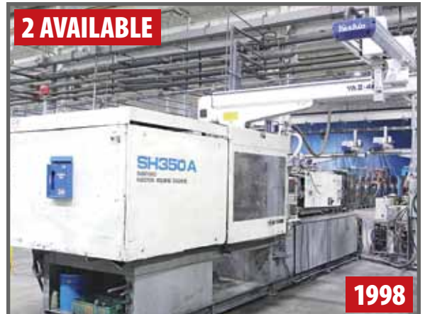
SUMITOMO 350 TON INJECTION MOLDER