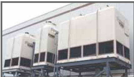
(3) ADVANTAGE COOLING TOWERS

ALSO: (65) PRESS MOUNTED MACHINE FEED/SUPPORT EQUIPMENT , including Una-Dyn and Conair Receivers and Hoppers; ECHO SYSTEMS MATERIAL DISTRIBUTION CONTROL PANEL , 25-Zone Master Controller P/N 941518-M/O 262418.07, 12-Zone Echo Annunciator P/N 941533-M/O 8000665; ECHO SYSTEMS MATERIAL DISTRIBUTION CONTROL PANEL , 37-Zone Master Controller, Power Supply, P/N 941516, M/O 31522.03; (6) IMCS MATERIAL STORAGE SILOS , Galvanized Steel, Bolted, 12' Diameter x Est. 26' High, Each w/(2) Electronic Level Monitors; LARGE QUANTITY OF ALUMINUM CONVEYING PIPING , w/Couplers, Connectors, etc.