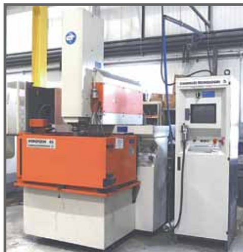
CHARMILLES ROBOFORM 40 CNC EDM

1996 CHARMILLES ROBOFORM 40 CNC RAM TYPE ELECTRICAL DISCHARGE MACHINE , S/N 600462, Table Size 29-1/2" x 19-1/2", Model 40-131102 Console Control, System 3R Rotary Workhead, 24-Position ATC, Fire Suppression System