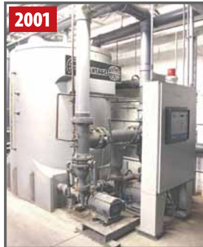
2001 ADVANTAGE TTK-1600-3P-FF PUMP STATION