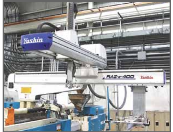
YUSHIN RAI-a-400 SERVO ROBOT