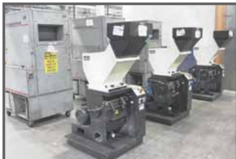
VIEW OF GRANULATORS