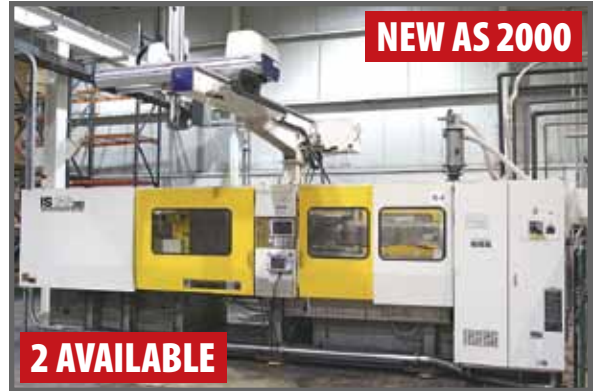
TOSHIBA 390 TON INJECTION MOLDER