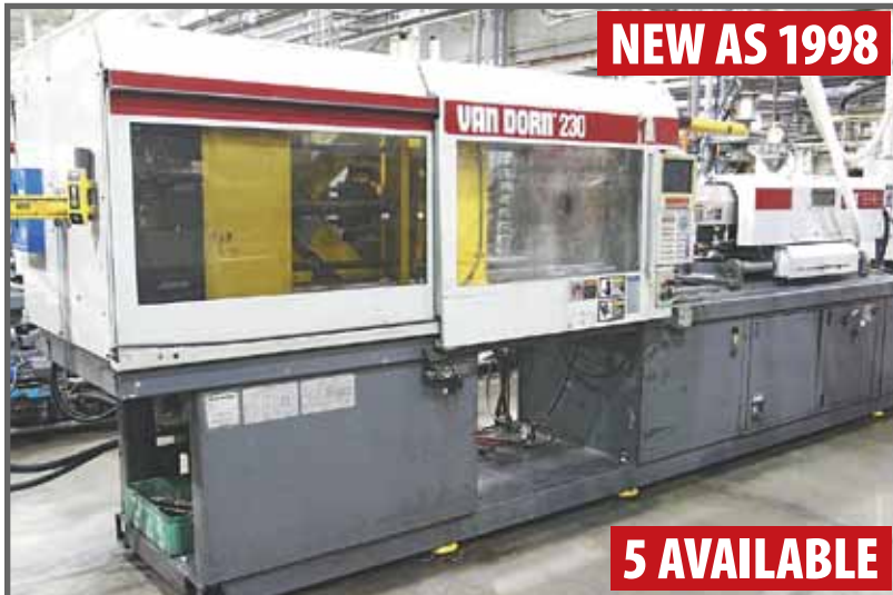
VAN DORN 230 TON INJECTION MOLDER

This brochure is only a partial listing. Please visit our website www.perfectionindustrial.com for more detailed listings and photos.