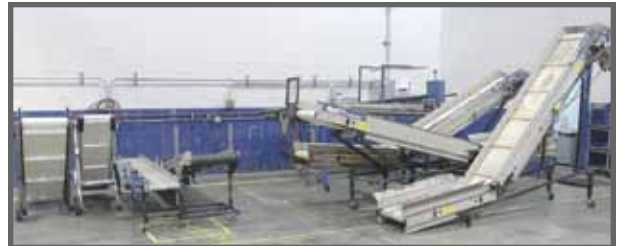
VIEW OF ASSORTED CONVEYORS