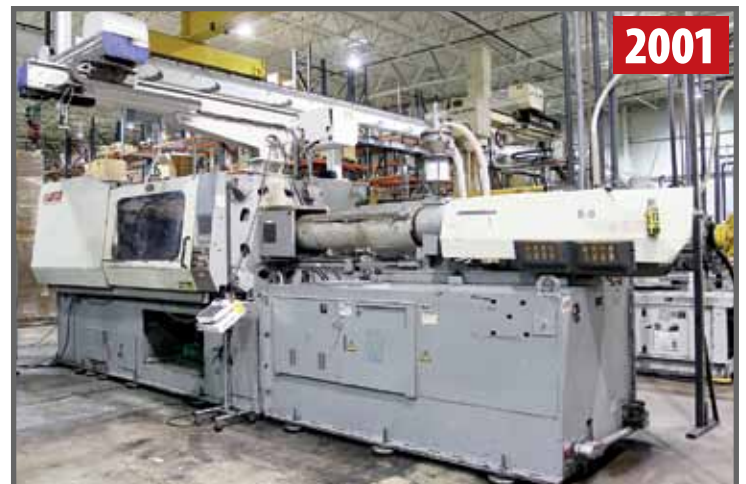
NISSEI 500 TON INJECTION MOLDER

View our current auction schedule at www.perfectionindustrial.com