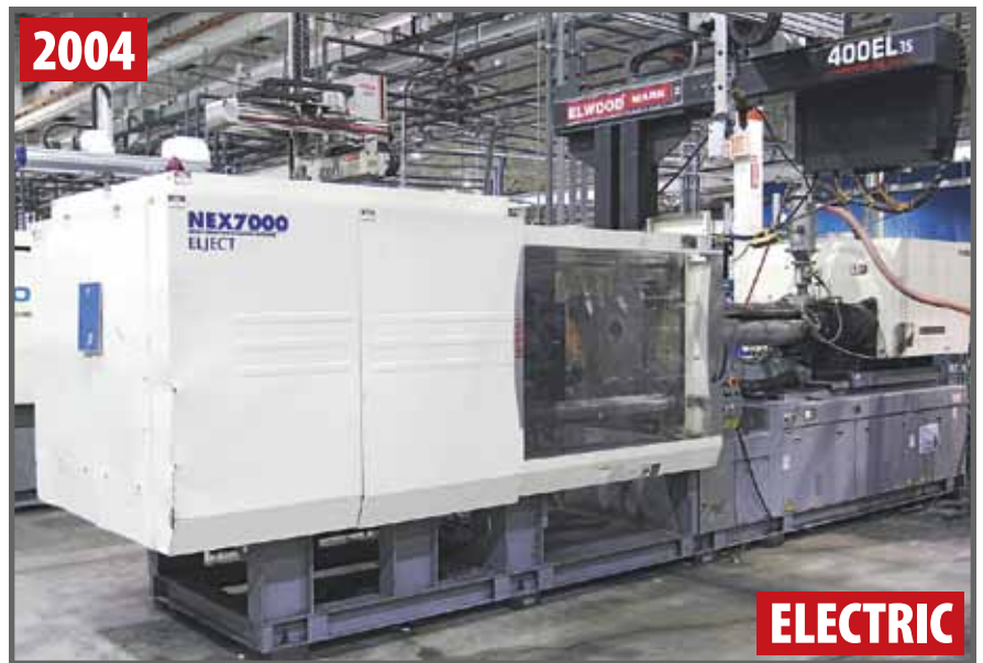
2004 NISSEI 400 TON ELECTRIC INJECTION MOLDER