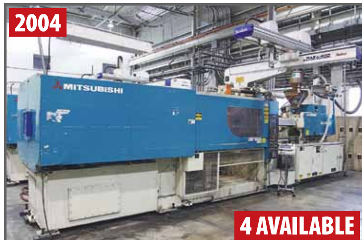
MITSUBISHI 500 TON INJECTION MOLDER