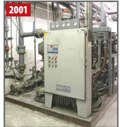
2001 ADVANTAGE 50 TON CHILLER

Sale Date: Thursday, May 16, Beginning at 9:00 AM EDT Location: 787 Renaissance Parkway, Painesville, Ohio 44077