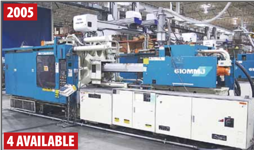
MITSUBISHI 610 TON INJECTION MOLDER