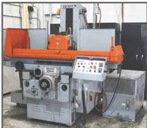
REGENT 12" X 24" HYD. SURFACE GRINDER