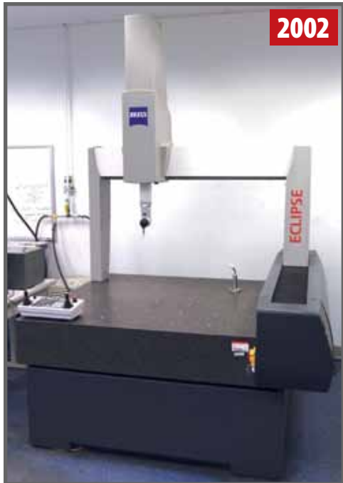
ZEISS ECLIPSE CMM