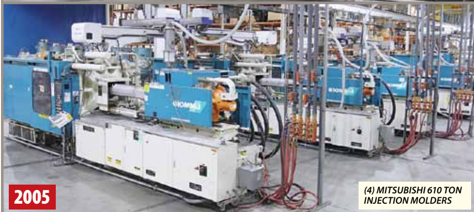
(4) MITSUBISHI 610 TON INJECTION MOLDERS

LARGE QUANTITY OF LATE MODEL ROBOTS, SECONDARY EQUIPMENT, TOOLROOM, MATERIAL HANDLING, PLANT SUPPORT & MISCELLANEOUS