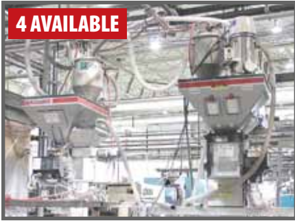
(2) MAGUIRE WEIGH SCALE BLENDERS