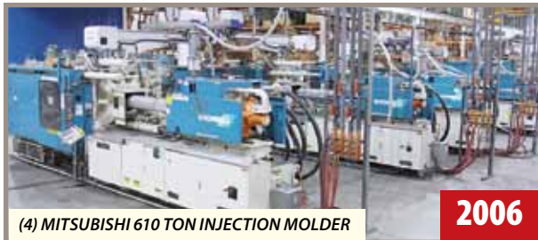
(4) MITSUBISHI 610 TON INJECTION MOLDER