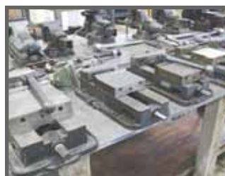
VIEW OF KURT VISES