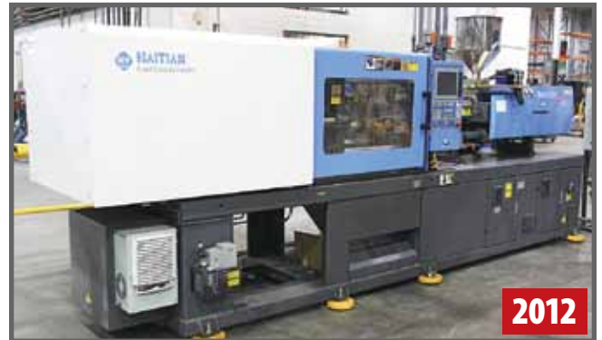
HAITIAN 180 TON INJECTION MOLDER

Online Bidding Available Through BidSpotter.com