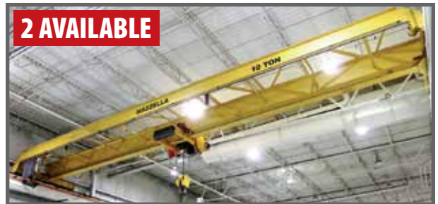
MAZZELLA 10 TON BRIDGE CRANE

P & H HAN-TEK 5-TON FREE STANDING BRIDGE CRANE, Est. 20' Span, w/6-Post Free Standing Structure, Est. 45' Length