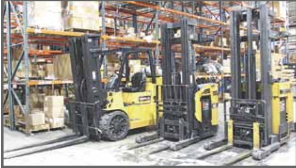
VIEW OF CATERPILLAR FORKLIFT & REACH TRUCKS

2010 CATERPILLAR GC70K 13, 450 LB LPG FORKLIFT , S/N AT8900904, 188" Lift, 3-Stage Mast, 98" Mast Height, Side Shift, 72" Forks