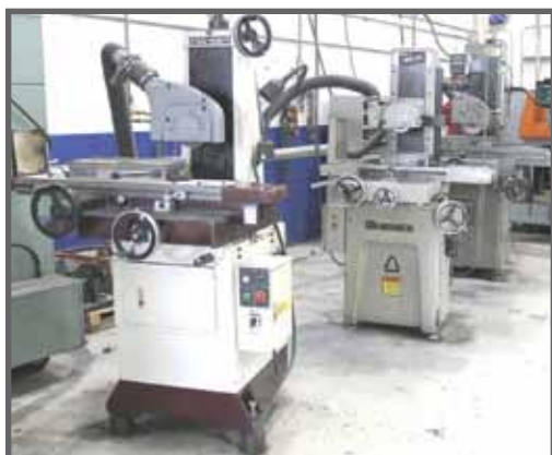
VIEW OF HAND FEED SURFACE GRINDERS