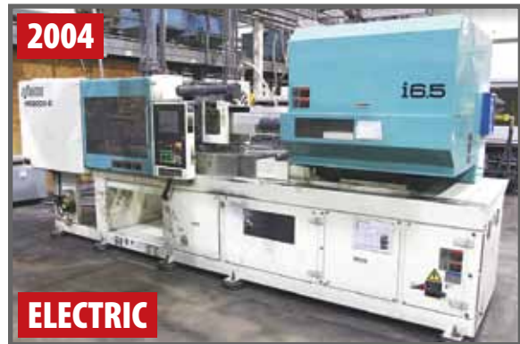
2004 NIIGATA 200 TON ELECTRIC INJECTION MOLDER