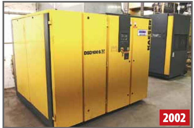
KAESER 100 HP AIR COMPRESSOR & DRYER