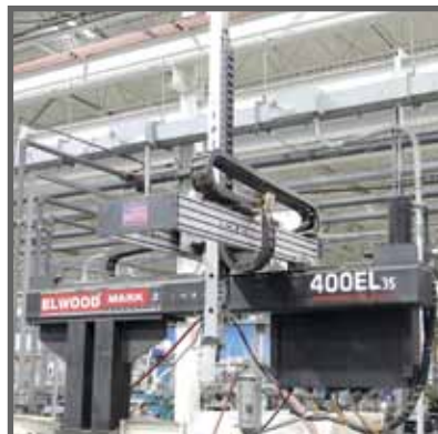
MARK II 400EL35 SERVO ROBOT