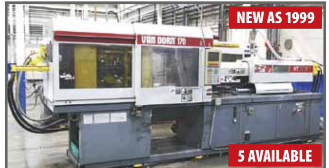
VAN DORN 170 TON INJECTION MOLDER

To discuss your requirements for an auction, please call Perfection Industrial 847.427.3333