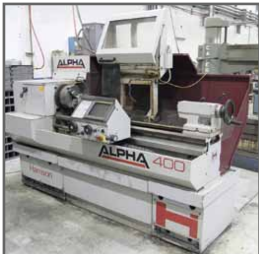
HARRISON ALPHA 400 CNC LATHE