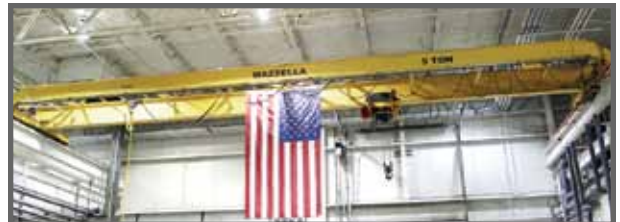
MAZZELLA 5 TON BRIDGE CRANE