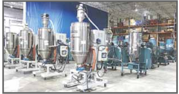
VIEW OF MATERIAL DRYERS

(2) CONAIR D150 MATERIAL DRYERS , CS150 Carousel Dryer Microprocessor Control, w/Model CH24-18 Drying Hopper, S/N 154123, Conair Dust Beater Vacuum Loader, Semi-Portable Stand