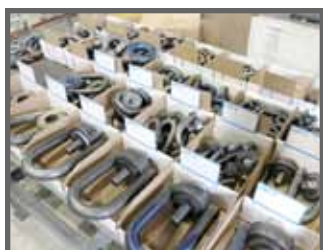
VIEW OF TOOLING