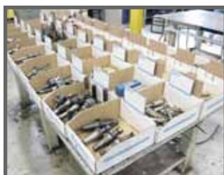
VIEW OF TOOLING