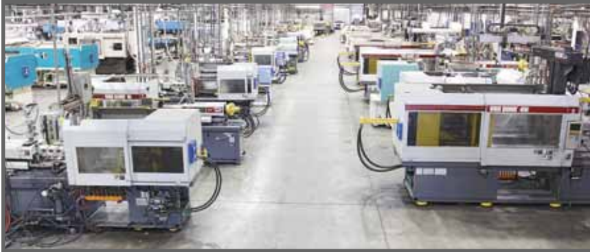
GENERAL VIEW OF INJECTION MOLDING MACHINES