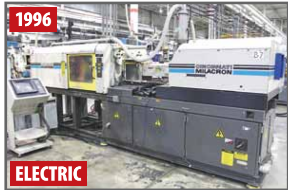
1996 CINCINNATI MILACRON 150 TON ELECTRIC INJECTION MOLDER