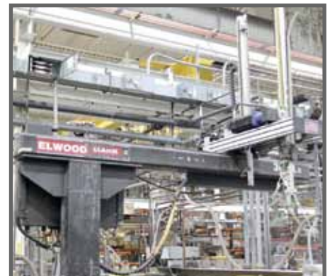
MARK II 360EL35 SERVO ROBOT

View our current auction schedule at www.perfectionindustrial.com