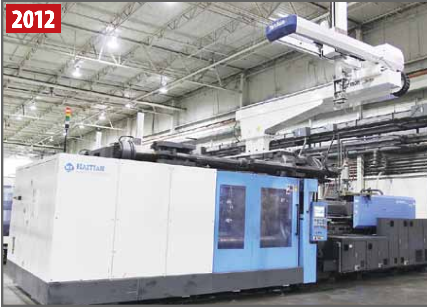
HAITIAN 1573 TON INJECTION MOLDER